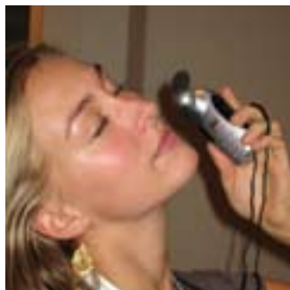
If there is no wind for the turbines offshore, this gadget from SGS provides a comfortable breeze.