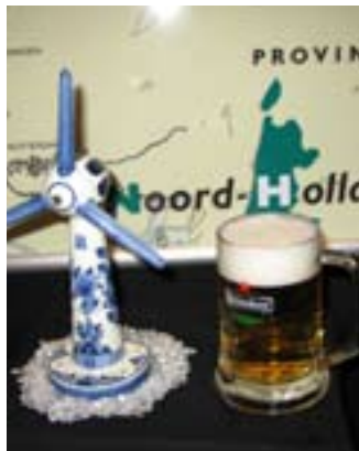
One of the rarest items comes from Holland. Who wouldn't like to have one of these turbines in a glass cabinet at home?