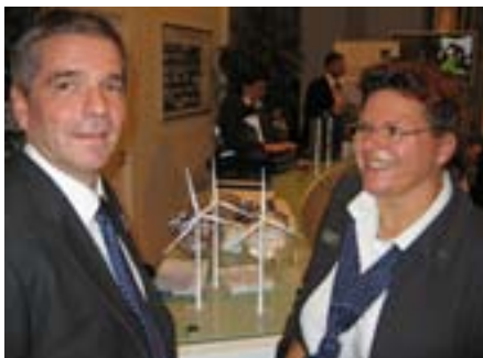
No wonder they look happy at the Vestas exhibition stand. In front of a counter full of company gadgets, two employees pose with both tie and scarf in blade design.