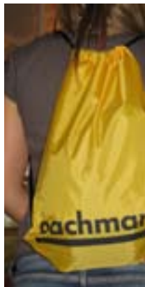
Out of the rather modest yellow bag, lucky visitors can retrieve a cool and fancy black rain coat from Bachmann AG.