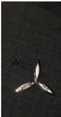
The BWEA pin has turned into a true classic.

The Independent COW went gadget hunting. And judging from the gadgets and accessories available at the COW exhibition, there is no reason to believe the wind industry's river of ideas will ever run dry. Check out a few samples from the lucrative hunt: